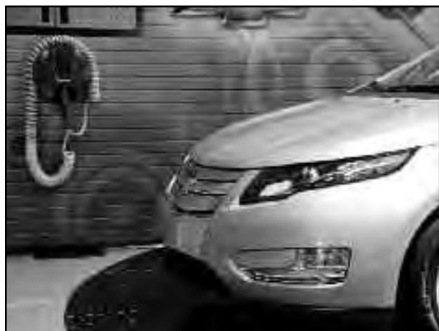
Figure 1.1.1 Electric vehicle supply equipment

This standard does not apply to other than Code compliant AC Level 1, AC Level 2 and fast charging DC (DC Level 2) EVSE, as well as to off-road, self-propelled electric vehicles, such as industrial trucks,