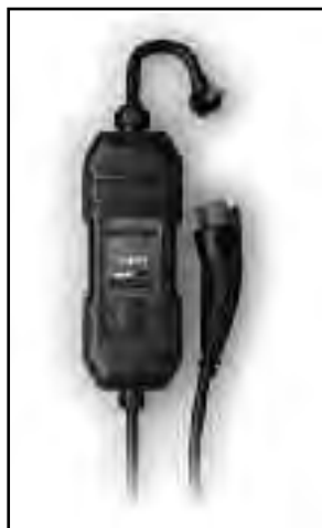
Figure 1.1.2 Photo showing typical AC Level 1 electric vehicle supply equipment (EVSE)

b) Only qualified persons as defined in the NEC® familiar with the construction and operation of Electric Vehicle Supply Equipment (EVSE) should perform the technical work described in this publication. Administrative functions and other non-