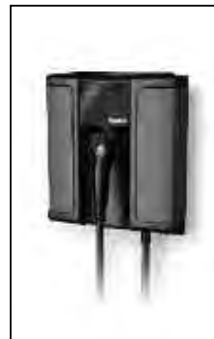
Figure 1.1.3 Photo showing typical AC Level 2 electric vehicle supply equipment (EVSE)